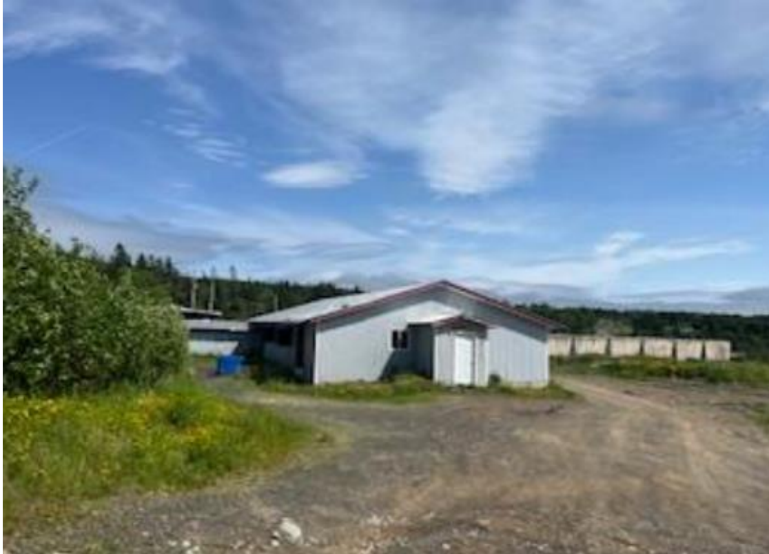
Old Dairy Barn